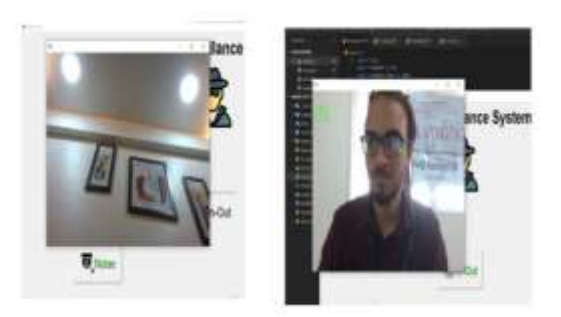
fig. 6. Visitors In-out Detection

Figure 5 shows the motion/ movement detection. Initially, when the frame is steady i.e when there is no movement going on in the frame it simply displays "NO-MOTION". Later, if there is any movement or disturbance visible in the frame it detects motion and displays "MOTION".