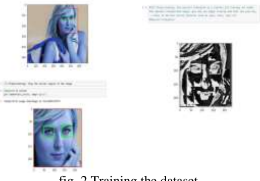
fig. 2 Training the dataset

For the object detection part, a pre-trained dataset was used with the help of darknet framework which was of 200 MB. Following are the results.