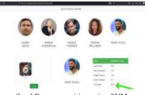
fig. 4 Face recognition using SVM

Above fig. 3 is the user interface of the homepage, which has five functions in it: real-time object detection, motion detection in a specific region, visitors in and out tracking, and saving recorded footage.