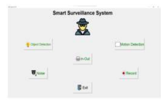
fig. 3 User Interface of the System

Above fig. 3 is the user interface of the homepage, which has five functions in it: real-time object detection, motion detection in a specific region, visitors in and out tracking, and saving recorded footage.